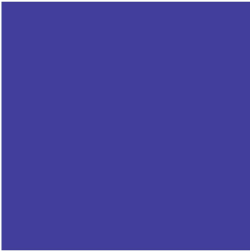
PANTONE Violet C

Approximate process color printing values: C90% / M90%