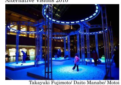
Ishibashi «Time Lapse Plant 2010 (4rings)»2010

"Yebisu International Festival for Arts & Alternative Visions 2010"