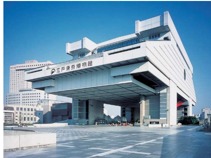
Tokyo Metropolitan Edo-Tokyo Museum