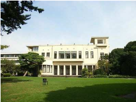
Tokyo Metropolitan Teien Art Museum

*The Museum of Contemporary Art Tokyo will extend open hours on October 29 (Sat) only.