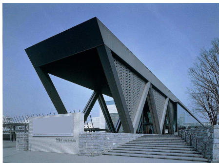
Museum of Contemporary Art Tokyo