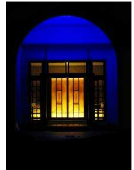
Tokyo Metropolitan Teien Art Museum Front Entrance

Dates: October 6 (Thu) – October 31 (Mon)