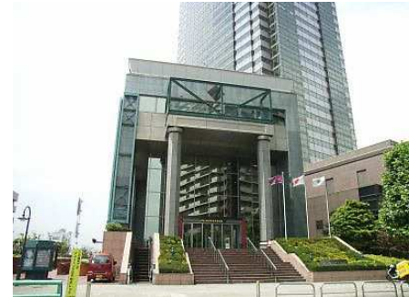
Tokyo Metropolitan Museum of Photography