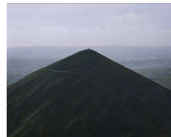
Terrils #02607 2009

Dates: October 14 (Fri) – November 30 (Wed)