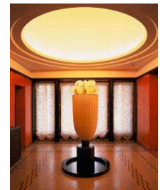
Anteroom & Perfume Tower