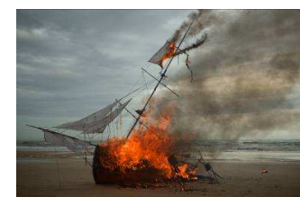
Dinh Q. Le «Erasure» video still, 2010 Mixed-media installation. Commissioned by the Sherman Contemporary