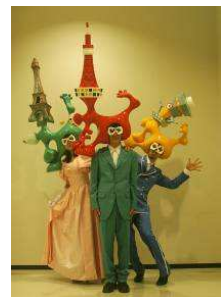
The Tower Dancers

Dates: October 8 (Sat) – November 23 (Wed)