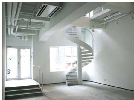
Tokyo Wonder Site Shibuya