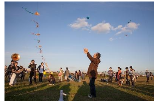
Otomo Yoshihide "Senju Flying Orchestra" (2012)

Joining the Senju residents combining to perform for this large-scale event will be a number of visiting groups, including "PROJECT FUKUSHIMA!", "Roppongi Art Night 2013," and the "Ensembles Parade" from the Sumida River Free Music Zone. This program will be the project's culmination.