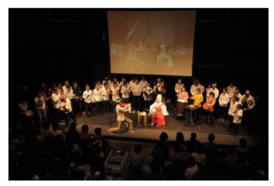
Senju Pun-filled Music Festival, The First Regular Concert (2013)