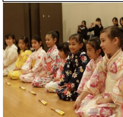
Programs for children

The latest information for programs in the future will be updated on the following official website (in Japanese and English)