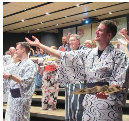
Programs for foreign visitors