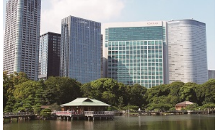
<Nakajima-no-ochaya of Hama-rikyu Gardens>

*Schedule and contents subject to change or cancellation without notice.