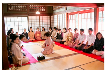
<Indoor Tea Ceremony > (Edo-Tokyo Open Air Architectural Museum)

Various schools of tea will join Tokyo Grand Tea Ceremony to help visitors feel the spirit of Omotenashi (Japanese hospitality) and casually experience Japanese traditional tea culture through various enjoyable programs that have attracted approximately 190,000 visitors in the past. Tokyo Grand Tea Ceremony is a loved and cherished Tokyo's autumn tradition which is not to be missed.