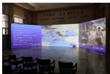
* From Manifesta 12 Casa del Mutilato, Palermo 2018

Worked as Chief Curator at Mercien Karuizawa Museum for 5 years. Dedicated to Musashino Art University as Professor for 12 years. Currently Artistic Director of the exhibitions of Maison de la Culture du Japon à Paris.