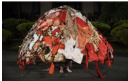
From “writtenafterwards” 2018 Spring/Summer Collection

“writtenafterwards” Fashion Show ※November 9 (Sat) 17:00~