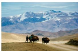
From “Silk Road” by Kishin Shinoyama

Special exhibition where the theme “FLOATING NOMAD” overlaps with the image of people on the trade route Kishin Shinoyama “Silk Road” Photo Exhibition