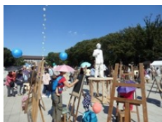
From the 2018 outdoor photo competition “Statue photo competition”

An upgraded version of last year's popular outdoor sketching event will be conducted “coconogacco” Outdoor Workshop