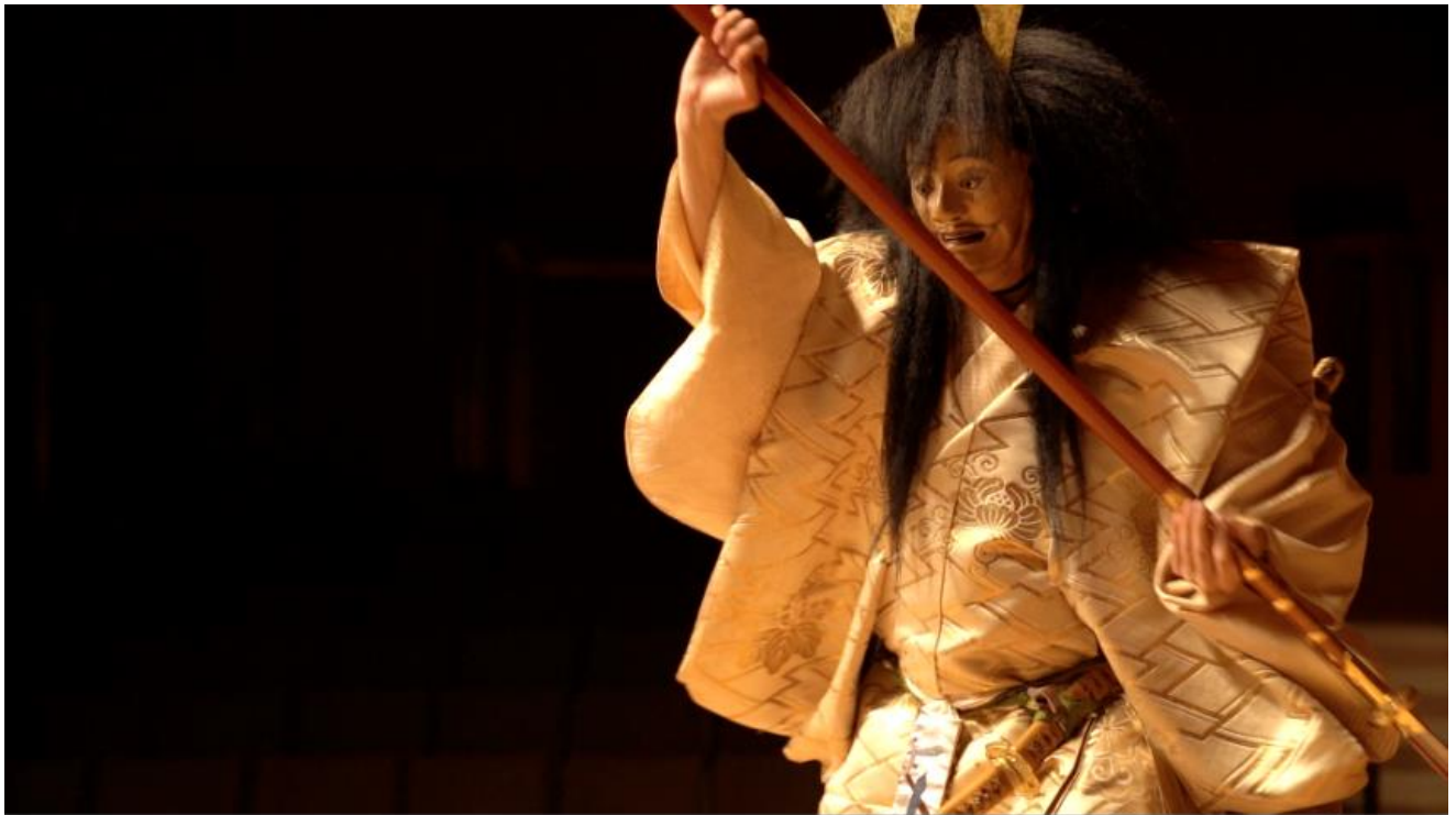
Taira no Tomomori (From "Noh Online: Funa Benkei, Legendary Hero, Riding the Wave from Tokyo to the World")

Based on the theme "Approaching Tokyo Tradition", Arts Council Tokyo, Tokyo Metropolitan Foundation for History and Culture, offers diverse projects and programs for people who are not familiar with traditional arts and culture, as well as for people overseas and children to enjoy Japan's authentic traditional arts and culture.