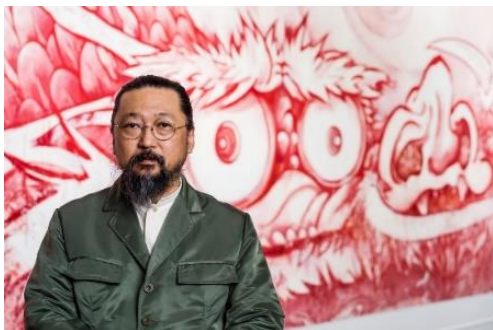
Photo by Museum of Fine Arts, Boston ©Takashi Murakami/Kaikai Kiki Co., Ltd. All Rights Reserved.

Seen from outside Japan, Tokyo is an extreme megalopolis. Like, a straight-out-of-Blade-Runner sort of metropolis. People may assume that beautiful robot girls walk around town.