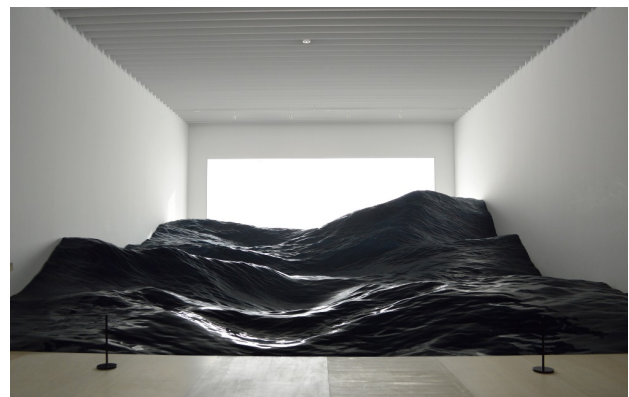
Contact (Roppongi Crossing 2019: Connexions, Mori Art Museum, Tokyo), 2019