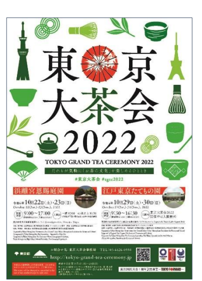
"Tokyo Grand Tea Ceremony2022" poster

Also, at Hama-rikyu Gardens, there will be Outdoor Tea Ceremony in English that you can enjoy tea culture and how-to with English explanations, Outdoor Tea Ceremony by High School Students where students from tea ceremony clubs in Tokyo will offer tea ceremony. And at Edo-Tokyo Open Air Architectural Museum, there will be Tea Ceremony in English.