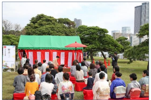
Outdoor Tea Ceremony – "Nodate" (Hama-rikyu Gardens)

*This event will be held in compliance with the event guidelines and venue usage rules issued by the national government and the Tokyo Metropolitan Government.