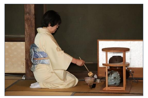
Tea Ceremony(Indoor) (Edo-Tokyo Open Air Architectural Museum)