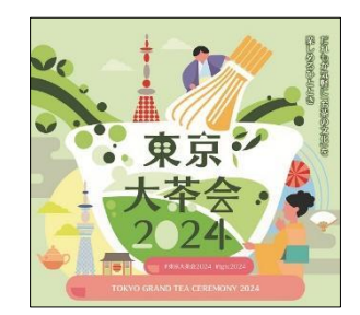
Promotional Image of Tokyo Grand Tea Ceremony 2024